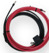
BATTERY CABLES READY TO USE 'PLUG & PLAY'