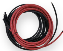
PV CABLES READY TO USE 'PLUG & PLAY'