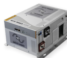
AUTO POWER 2000W 091-269-12-2000