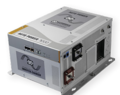
AUTO POWER 3000W 091-269-12-3000