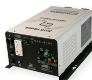
AUTO POWER 1500W 091-263-12-1500