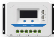
30A CHARGE CONTROLLER