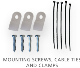
MOUNTING SCREWS, CABLE TIES AND CLAMPS