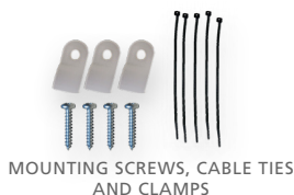
MOUNTING SCREWS, CABLE TIES AND CLAMPS