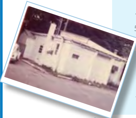
1969-1980 1,000 sq. ft.