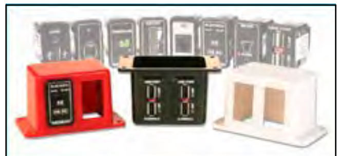
091-255 Switch Enclosure (Switches and Indicators not included)

Available in 3 colors: Red, Black and White Each unit carries a 3 year warranty