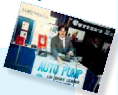
2003-present 20,000 Sq. Ft.

The Auto Pump, also a trademark product for the company was improved around 2005 when at an emergency vehicle technician training session a technician approached us and asked for a better way of getting rid of the excess moisture and water building up in a pump. The following year we returned with the Auto Drain a new product which solved the moisture problem. Now the Auto Drain is offered in a configuration for all pump models.