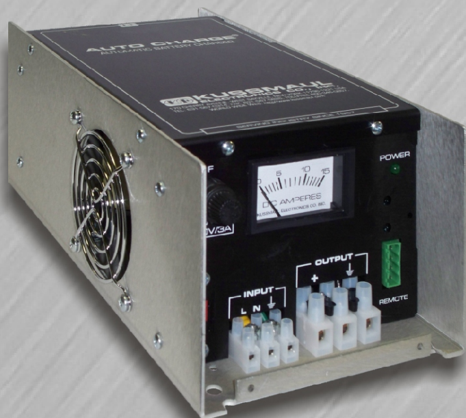
MODEL # 091-165-12-DV

Ideally suited for vehicles used in localities, which may have only 230 volts, this charger has an input voltage selector switch. The Auto Charge 12 DV is a fully automatic battery charger for vehicles with a single battery. Unique electronic sensing circuits sense the true battery voltage while eliminating the need for external sense wires. The maximum output of the charger is 12 amperes. When the battery is fully charged, all charging stops. There is no overcharging and no water boil off. It is ruggedly constructed for mounting in the vehicle.