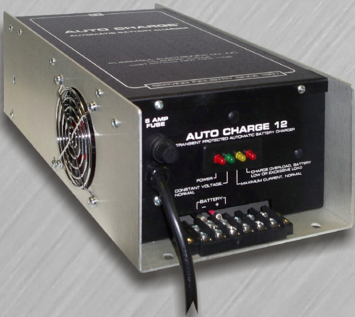
MODEL # 091-80-12

The Auto Charge T Transient Suppressed is a fully automatic battery charger for a single battery system. This float charger is transient protected to ANSI/IEE C37.90.1-1989 standard. Ideal for maintaining batteries in circuit breaker applications for electric utilities. Similar to Auto Charge 2 except higher output current. It is ruggedly constructed for mounting.