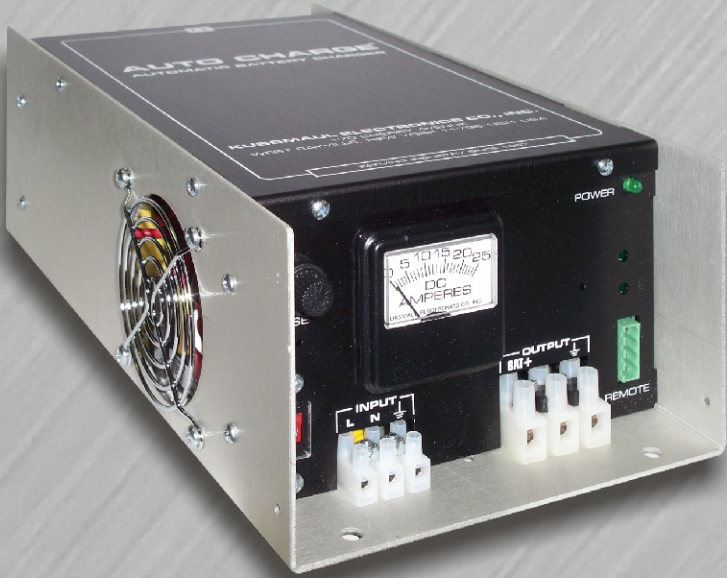
MODEL # 091-170-DV-12

The Auto Charge 12 HO DV, Model 091-170-DV-12, is a high output fully automatic battery charger for vehicles with a single battery system. Ideally suited for vehicles used in localities, which may have only 230 volts, this charger has an input voltage selector switch. A patented "Sample & Hold" circuit is utilized to detect the actual battery voltage. This eliminates the error due to the current flowing in the charging wires and assures that the battery is charged to the precise float voltage. A current limiter prevents overloading the charger when charging a deeply discharged battery or driving large parasitic loads. The charger is ruggedly constructed to assure reliable operation when mounted in a vehicle.