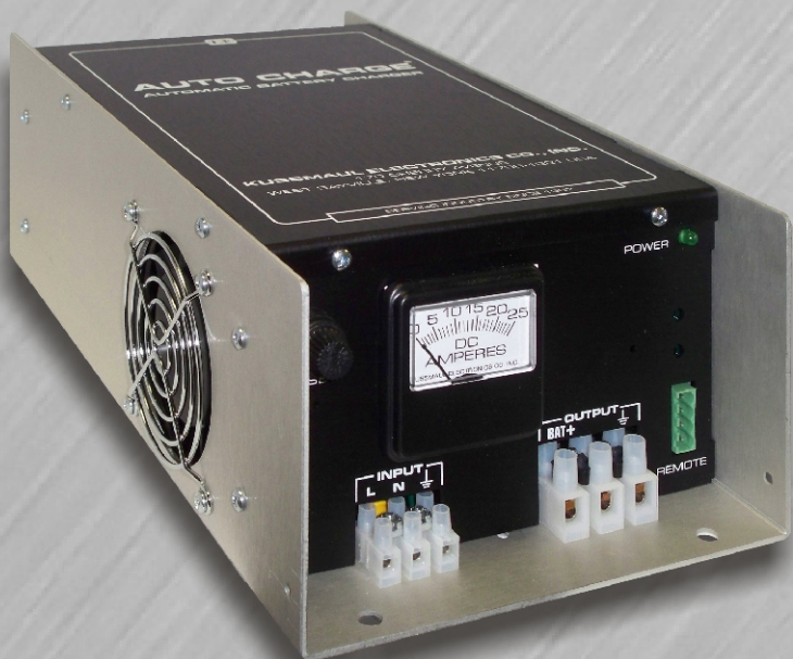
MODEL # 091-170-12

The Auto Charge 12 HO, Model 091-170, is a high output fully automatic battery charger for vehicles with a single battery system. A patented "Sample & Hold" circuit is utilized to detect the actual battery voltage. This eliminates the error due to the current flowing in the charging wires and assures that the battery is charged to the precise float voltage. A current limiter prevents overloading the charger when charging a deeply discharged battery or driving large parasitic loads. The charger is ruggedly constructed to assure reliable operation when mounted in a vehicle.