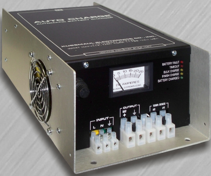
MODEL # 091-120-12-20