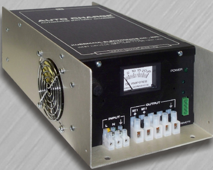
MODEL # 091-11HO-12

STANDARD DUAL SYSTEM BATTERY CHARGER FOR LARGER BATTERIES