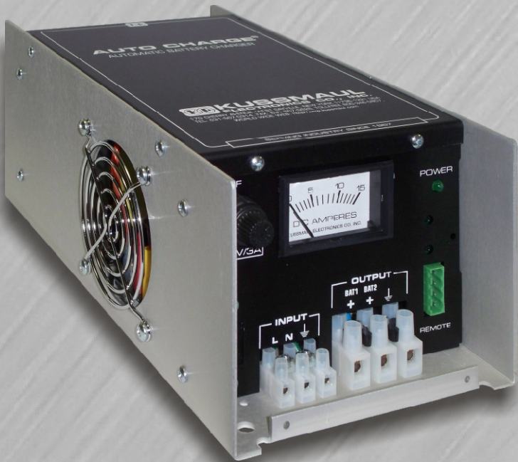
MODEL # 091-11DV-12

Ideally suited for vehicle used in localities which may have only 230 volts, this charger has an input voltage selector switch. The Auto Charge 11 DV is a fully automatic battery charger for vehicles with dual battery system. Remote voltage sensing is provided to compensate the charger output for the voltage drop in the charging wires. It is ruggedly constructed for mounting in the vehicle. This charger is ideal for vehicles with similar sized batteries and equal or no parasitic loads.