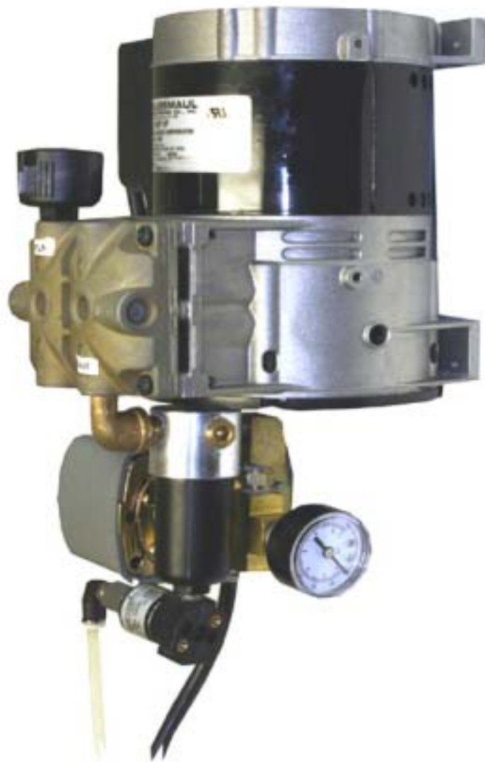
091-9-090 AUTO DRAIN ACHP INSTALLED ON 091-9HP AUTO PUMP